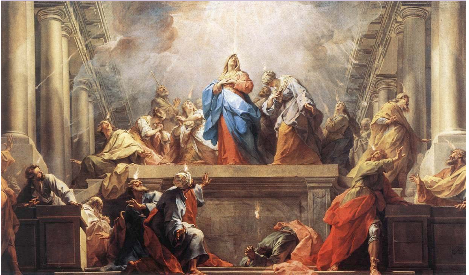
'The Pentecost' by Jean II Restout (1732)