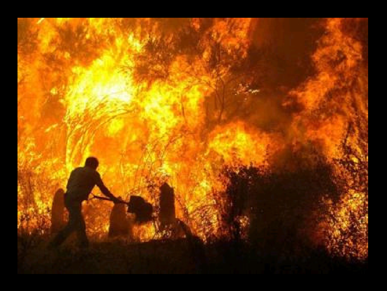
"The tongue is a fire . . ."