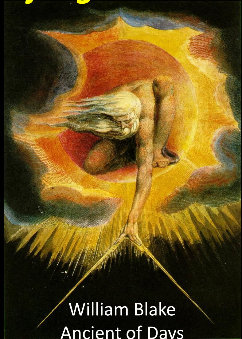
William Blake Ancient of Days

Son of Man given dominion over the nations.