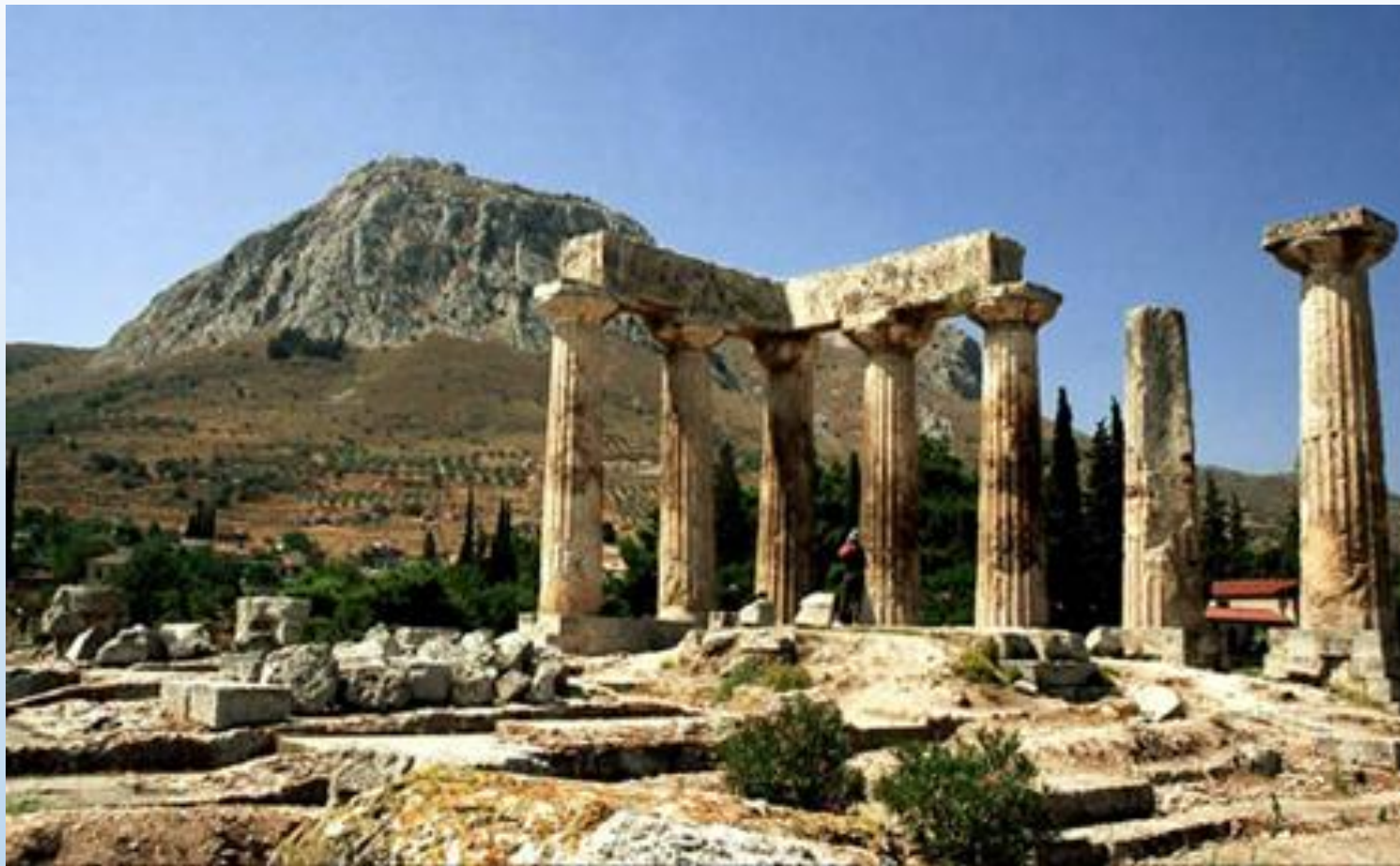
Temple of Apollo at Corinth